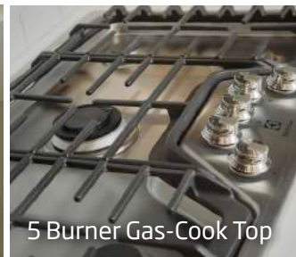
5 Burner Gas-Cook Top